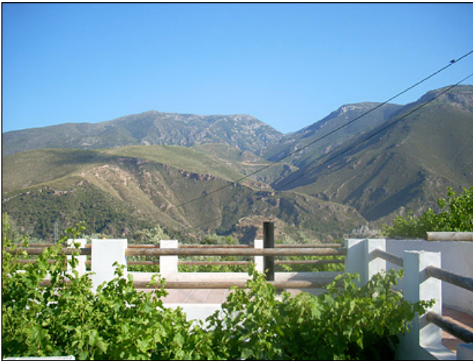
Roof terrace mountain views and exclusive courtyard